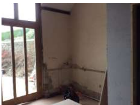
Foyer – the new front door and the site of the “flower area”

I provide below a sketch which shows the layout. Nothing will be in the same place, except the back door!!