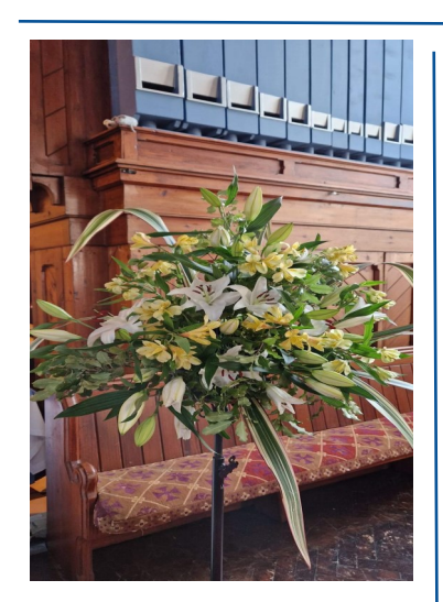
St Paul's Easter Day