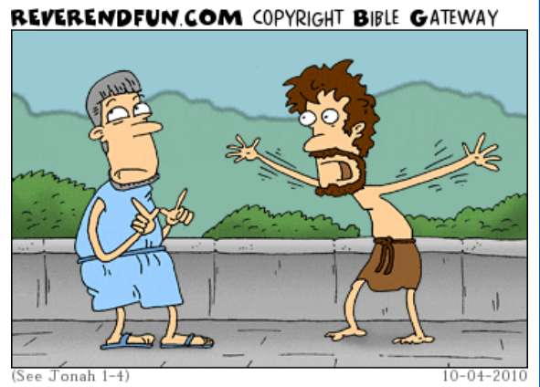
JONAH ATTEMPTS TO SHARE HIS TALE WITH DOUBTING THOMAS

All welcome to a half hour of prayer on Tuesdays at 9am. Just click on <a href="mailto:this link">this link</a> or go to <a href="https://zoom.us/join">https://zoom.us/join</a> and enter: Meeting ID: 575 020 5964 and Passcode: 850653.