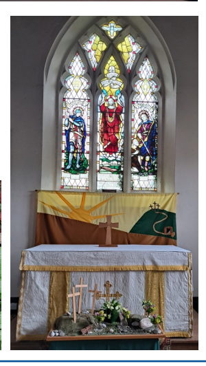
St Mary's, Cofton