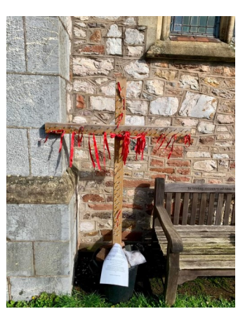
St Paul's, Starcross