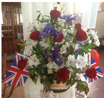
Photo aside: Just a reminder of one of the spectacular floral displays at the last Flower Festival for the Platinum Jubilee of Elizabeth II

There will be more updates from me over the next few months and requests for things but meanwhile hold the team working on the festival, in your prayers, and pray it will be a grand celebration of centuries of God's work in this community of Dawlish.